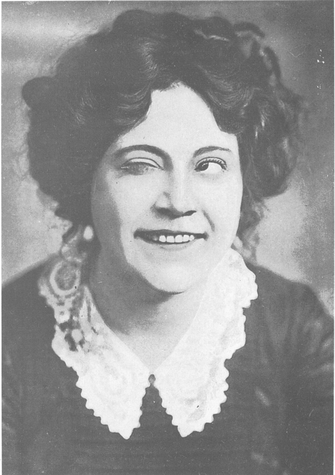
The image of the 'bad girl', encapsulated in the photograph of Violet Englefield on the front cover of the Souvenir celebrating the one hundredth performance of The Bad Girl of the Family at the Aldwych on 11 March 1910. Her face, which dominates the photograph, faces the camera, but her eyes are turned upwards and away in a knowing, possibly suggestive, wink to an unseen observer.