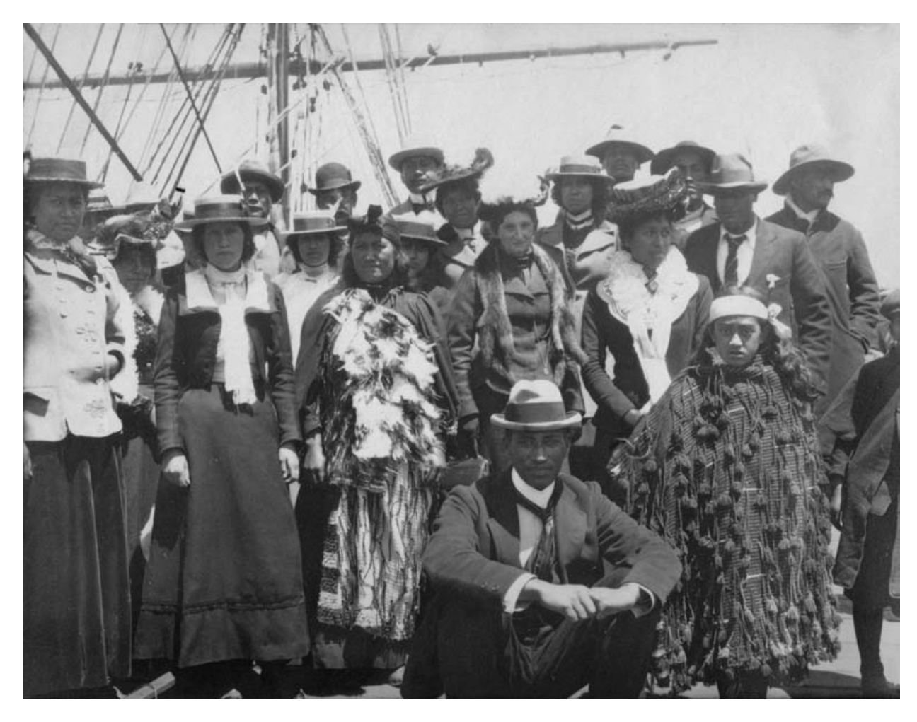
Fig. 4. Maori visitors on board, Lyttleton (c.1901-04).

(Fig. 4). The return visits from Maori to Discovery were recorded in photographs in the Royal Geographical Society photographic archives. Wilson recorded: