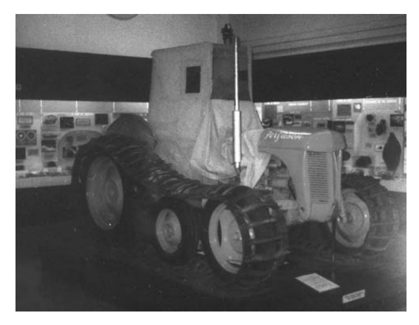
Fig. 3. Sir Edmund Hillary's tractor from the Commonwealth Trans-Antarctic Expedition (1955–58). It is exhibited in the Canterbury Museum in Christchurch.

all) historic and contemporary Maori connections to the Antarctic and Southern Ocean.