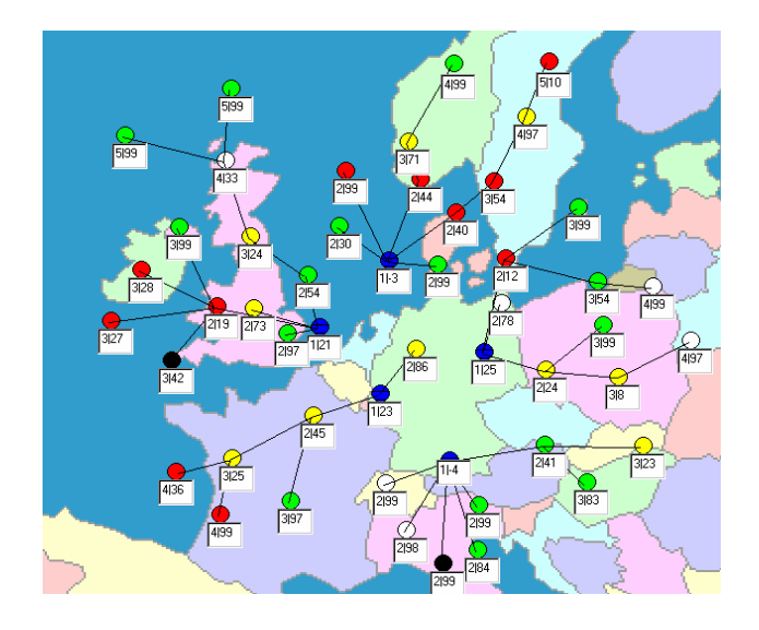
Figure 1. Snapshot of Ad-Hoc network. Node Routing Level | Fitness.

penalties for deleting data or dropping it due to full queues. The initial settings for the node are randomly decided. Figure 1 shows a snapshot of the network. The different shades of the nodes represent the 5 behaviours and the values beneath the nodes represent node routing level and fitness.