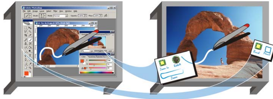
Figure 1: VoodooSketch allows controls to be taken out of the graphical user interface to be deployed on the physical palettes.

Figure 1 also shows that the system deploys a special digital pen, which can be used across palettes and the graphical work surface. The palettes are covered with augmented paper, allowing the pen to write on it with real ink, as well as to digitally track the pen activity. This allows the system to recognize shapes and to recognize the handwritten labels. On the work surface, the pen serves as a pointer-like input device.