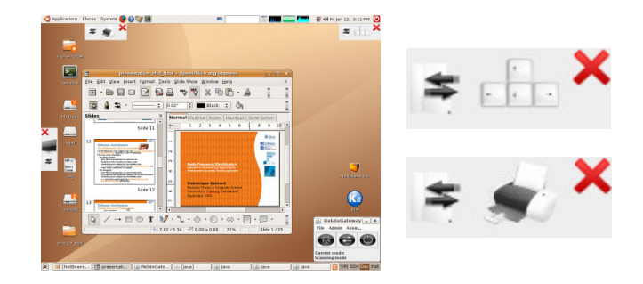
Figure 3. Left: User interface running on a Linux laptop Right: Detailed view of two gateways.

As shown in Figure 3 (left) the gateway interface is designed to be a seamless extension of any existing desktop-style interface. The concept is to integrate the gateway in an unobtrusive manner at the perimeter of the screen but closely integrated such that direct interactions with the desktop or with other applications are facilitated. To achieve this, the user interface was implemented as a portable Java application using Swing GUI components. In order to be able to move the gateways around the screen they are implemented as small windows whose position can be controlled.